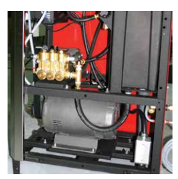
Thermostat control is located behind the front panel. This allows the temperature to be set at a desired level and prevents unnecessary tampering, resulting in less fuel consumption.