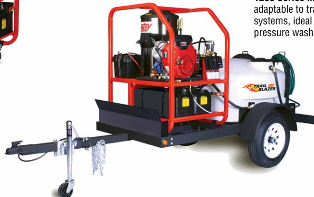
1270SS (shown with optional Portagear Kit)

1200 Series models are easily adaptable to trailer-mounted systems, ideal for mobile pressure washing